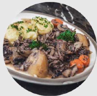
RAGOÛT DE BOEUF À LA BOURGUIGNONNE - BEEF STEW 120K