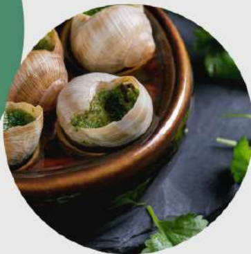
ESCARGOTS 11 PIECES OF SNAILS IN GARLIC BUTTER SAUCE & BREAD 85K