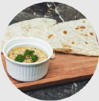
HUMMUS PITA 50K