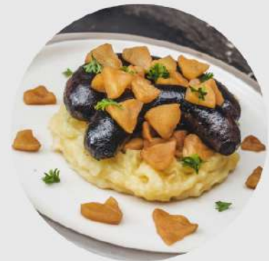
BOUDIN NOIR AUX POMMES FRENCH BLOOD SAUSAGES MASHED POTATOES AND APPLE CONFIT 95K