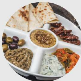
MEZZE HUMMUS, TZATZIKI, MARINATED BELL PEPPER, OLIVE, TOMATO & PITA BREAD WITH 3 EXTRA FALAFELS OR 2 BEEF KOFTAS 95 / 125 NOOMA DELICATESSEN 95/125K