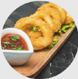
VEGETARIAN SPRING ROLLS 35K