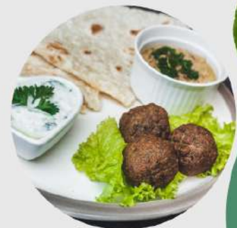
FALAFEL PITA CHICKPEAS HUMMUS & TZATZIKI 65K