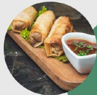
CALAMARI RINGS 50K