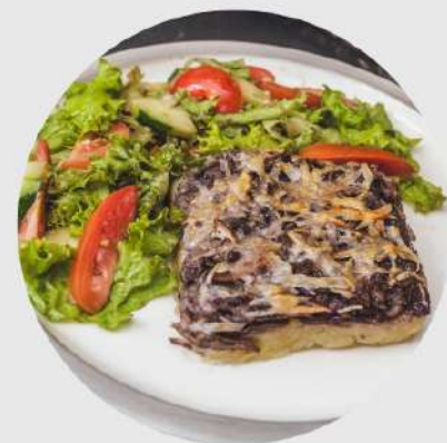
PARMENTIER DE CANARD DUCK SHEPHERD'S PIE WITH SALAD 95K