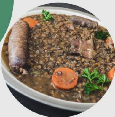
PETIT SALÉ AUX LENTILLES STEW GREEN LENTILS, CURED SMOKED PORK BELLY AND SAUSAGES 120K