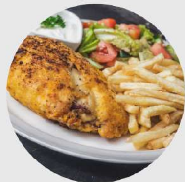
CHICKEN CORDON BLEU TENDER CHICKEN ROLLED WITH HAM & CHEESE BREADED CRISP & BAKED GOLDEN 95K