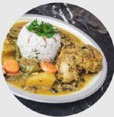
COLOMBO DE POULET CARIBBEAN CURRY WITH TROPICAL VEGETABLES AND PLANTAIN BANANA 75K