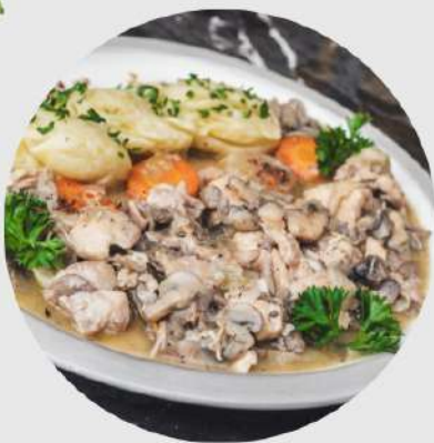
BLANQUETTE DE VOLAILLE CHICKEN, CARROT, TURNIP MUSHROOMS IN CREAMY SAUCE 75K